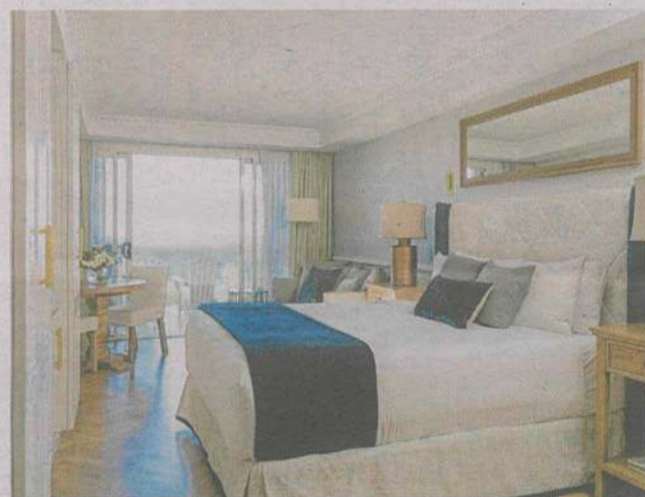
Jonah's terrace overlooking the southern headland at Whale Beach, main; pool vista, top left; early morning on the beach, below; refurbished guestroom, left; dessert delight, inset

Aboard the spick Benéteau Oceanis vessel, Michael offers a choice. We can raise the sails and breeze about; head for a secluded beach for a swim and picnic; or motor around the waterway taking in its sights such as Scotland Island and Lovett Bay, lunching onboard on