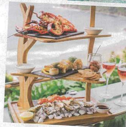
What better way to romance than with a shared seafood platter for two?

For those who want to go all out and arrive by a seaplane, Jonah's can make the arrangements – along with a host of other bespoke experiences. jonahs.com.au