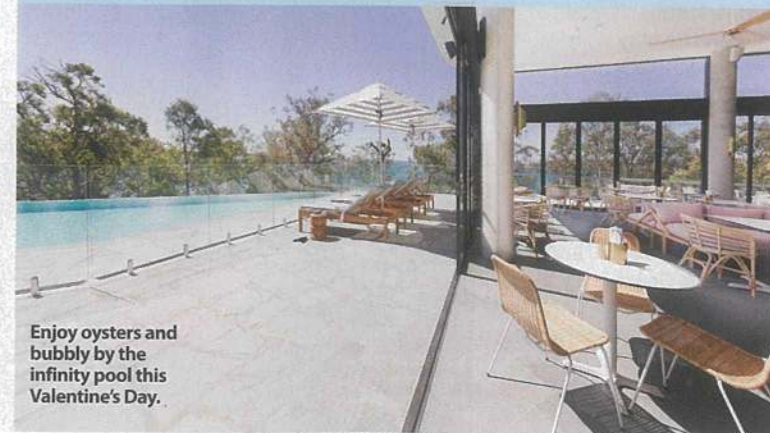
Enjoy oysters and bubbly by the infinity pool this Valentine's Day.