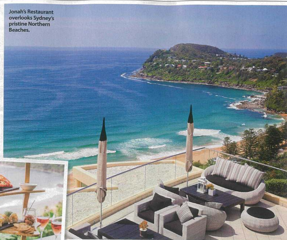
Jonah's Restaurant overlooks Sydney's pristine Northern Beaches.