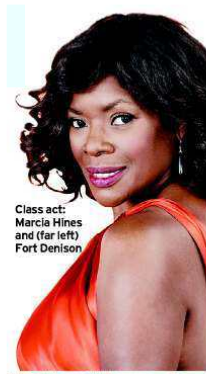
Class act: Marcia Hines and (far left) Fort Denison